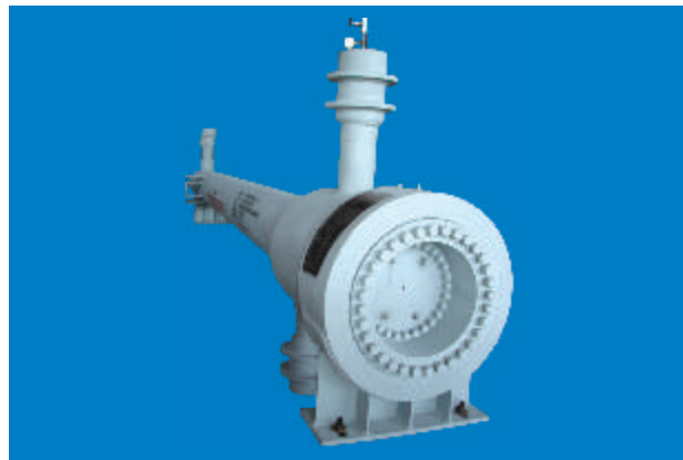
Hi Feed / Effluent Exchanger (Surface Area- 512.96. Sq.ft). Manufactured for M/s. Dynamic Fuels LLC, Oklahoma, USA.