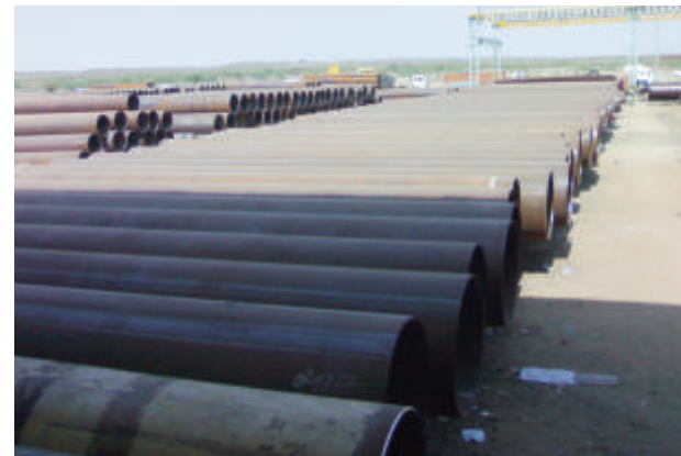
API 5L X 65/70 line pipes, with 3LPE coating inspected for export to Nigeria. More than 1000Kms of Pipe Lines Inspected for clients in various countries.